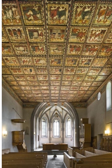
Painted ceiling of Zillis

On our day trip we discover an area full of medieval castles and churches, and picturesque villages, embedded in a vast bucolic landscape of pastures, forests, and mountains. In short: on this smooth tour you will get to know a beautiful landscape with many hidden treasures.