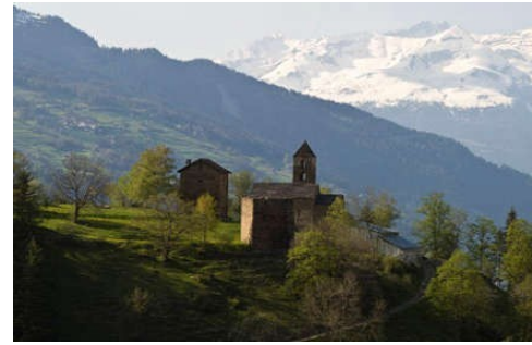
Landscape in Domleschg