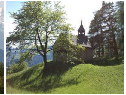
Chapel St. Maria Magdalena, Paspels

Departure: Sunday, October 15, 08.30 Uhr at the Meeting Point, Blumenbergplatz 9. The excursion takes place, rain or shine; weather-related program adjustments are possible.